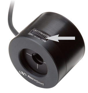
Figure 1 – Model 918D attenuator 'ON/OFF' dial

44640-02RevD 5-5x7-5_44640-01RevA 5-5x7-5.qxd 8/12/10 3:15 PM Page 8