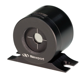
Figure 2 - Model 918D mounted on Base

A base plate kit (Model 918D-Base-Kit), consisting of the plate and mounting screws, is available for using the detector on a flat surface or optical table. A total of 5 screws are provided: 1 set screw to attach the base plate to the detector and 4 screws for attaching the plate to an optical table (2 Metric and 2 English)