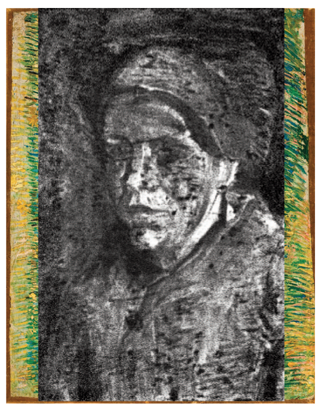
Fig. 2: Elemental map obtained on Vincent van Gogh's "Patch of Grass" showing a hidden portrait of a woman; Sb distribution