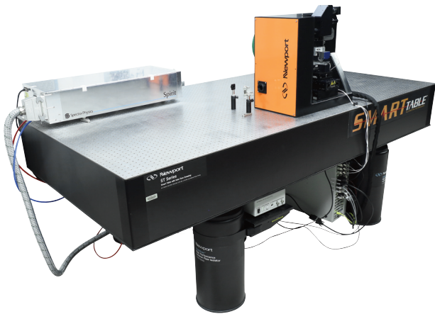
Newport's femtoFBG with a Spectra-Physics Spirit laser.