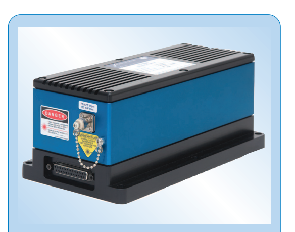
TA-7600 VAMP Tapered Amplifier