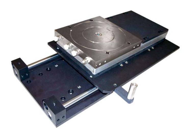
PVIV-TC-VAC - Temperature Controlled / Vacuum Positioning Cell Holder for 2 x 2 through 6 x 6 Cells