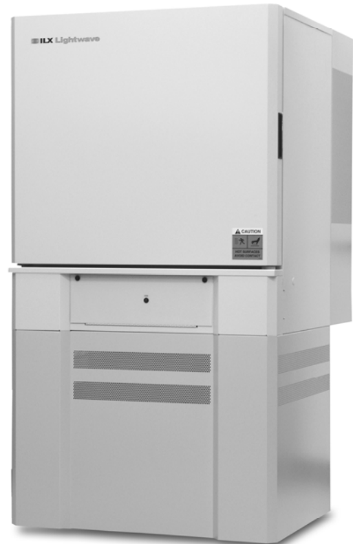
ILX Lightwave's LRS-9424 Laser Diode Reliability and Burn-In Test System

There are three common analysis methods to calculate laser diode threshold current as defined by the Bellcore standard for Generic Reliability Assurance Requirements of Optoelectronic Devices used in Telecommunications Equipment (GR-468-CORE, Issue 1, December 1998). They are the two-segment fit, first derivative, and second derivative methods.