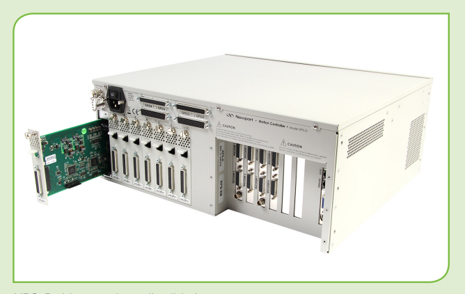
XPS-D driver cards easily slide in