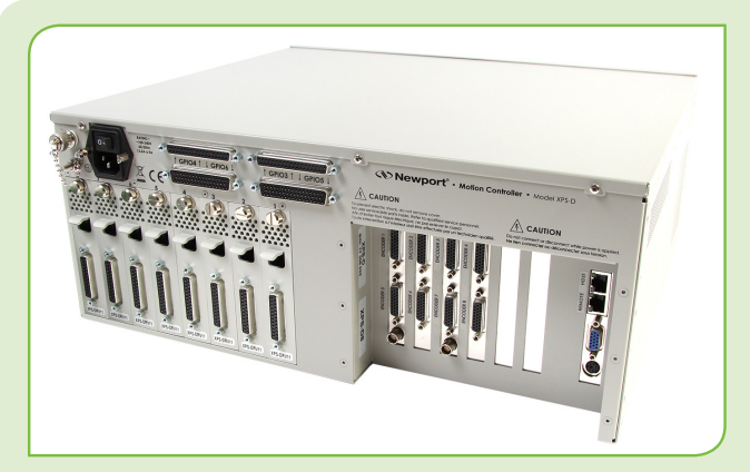
XPS-D8 rear panel shown with driver cards installed