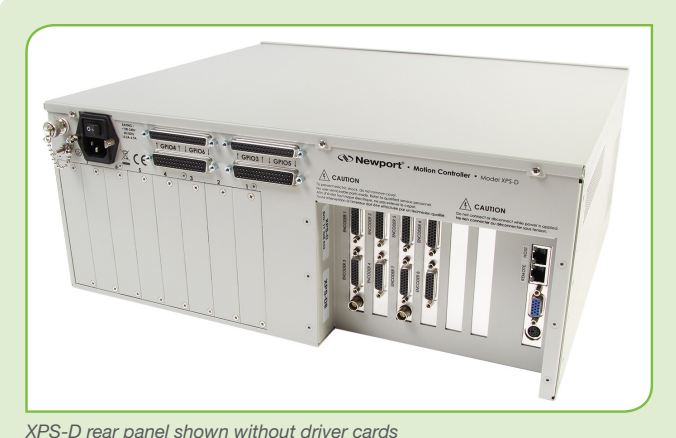
XPS-D rear panel shown without driver cards

the XPS-D to drive any bipolar stepper, DC brush, and direct drive motor stages. Although the XPS-D is backward compatible with the older DRV0x cards, it is highly recommended to use the XPS-DRV11. By using the XPS-DRV00P pass-through drive module, the XPS can use external amplifiers/drives through step/direction or analog signals to operate third party motors. XPS-DRVP1 can control Newport's Nano positioning piezo stack devices. All driver modules must be purchased separately. For more information please visit our drive module webpage: https://www.newport.com/f/xpscontroller-driver-modules