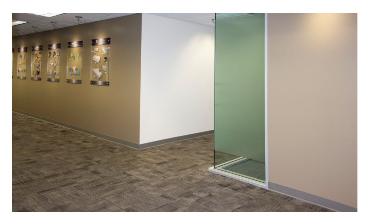
Be sure you can maneuver around corners when transporting your optical table to your lab