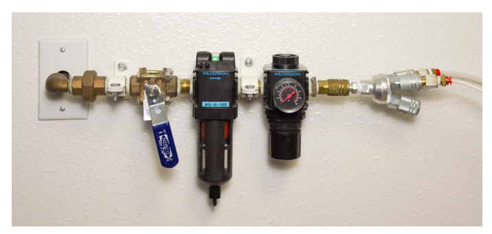
Compressed air lines installed in lab

Note that the maximum operating pressure for the system is 90 psig (6.3 kg/cm<sup>2</sup>).