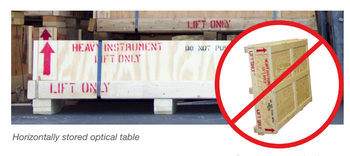
Do not store vertically

Optical table tops should be stored horizontally to maintain flatness and minimize the risk of damage or injury. It is best to leave the optical table in its crate during storage and we recommend not uncrating the table only after it has reached your lab. Do not store your optical table outdoors.