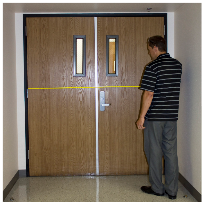
Measure doorways to ensure your optical table can fit

You should plan the route that will be used to transport the optical table to your lab. Depending on the size of your optical table, you may have difficulty moving through hallways, doorways and around corners or up stairs. Remind those moving the table top that an allowance should be made for the crate. Adding 4" to each dimension is approximate but call Newport for exact crate dimensions.