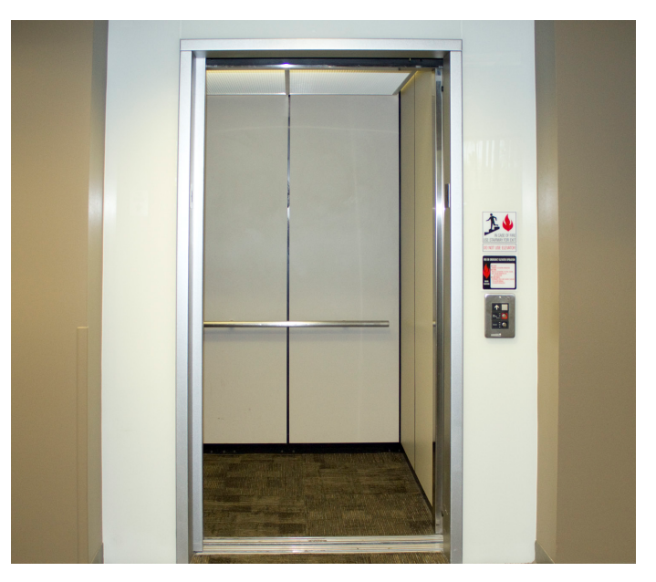
Check size and load capacity of your elevator

Elevators may be needed to move your optical table. Be sure that the load capacity and the size of the elevator are adequate for your optical table. Make sure the table can fit in the elevator. Tables may be moved in the vertical orientation to fit in elevators, through doorways and around corners.