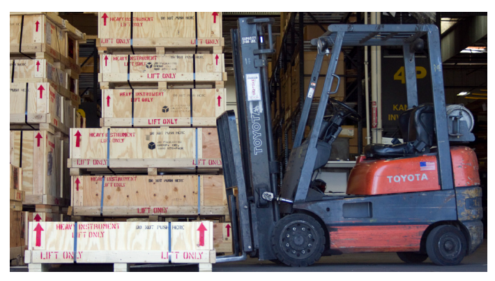
Forklift with crated table

A forklift may be required to remove the optical table from the delivery truck. The load capacity of the forklift must be adequate. The graph on back page can be used to estimate crated and uncrated table weights.