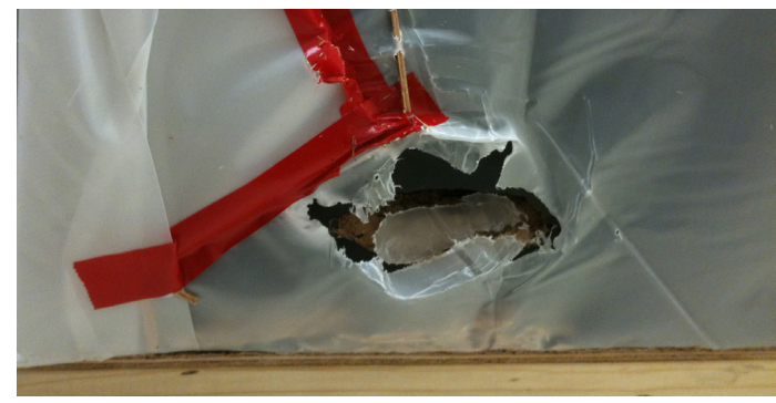
Shipping crate with a hole in the side caused by a forklift

*The freight carrier will contact the customer within 48 hours to arrange for the inspection.