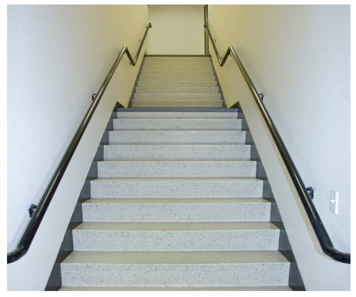
Be aware of obstacles such as stairs