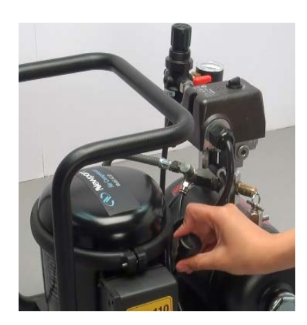
Remove rubber plug and install air intake filter

3) Remove the rubber plug on the oil pipe.