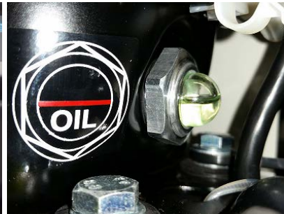
Add oil and check oil level