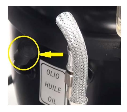
Remove rubber plug on the oil pipe

3) Remove the rubber plug on the oil pipe.