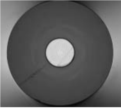
FIGURE 3. A ytterbium-doped dual-clad PCF (seen in cross section) serves as a fiber laser. With an NA of 0.62, its multi-mode pump core accepts laser-diode light; the laser emits single-mode light in the 1000- to 1100-nm range with a beam quality M^2 of approximately 1.2.