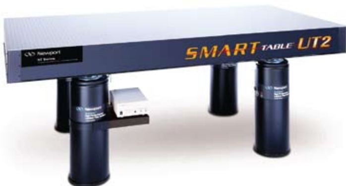
FIGURE 1. The Newport ST-UT2 Series optical table can be upgraded with an iQ active damper system (shown) without dismantling your experiment (left). The 5300 Series optical table from Kinetic Systems features broadband damping plus quad-tuned dampers in each corner. Retractable castors are an optional accessory (right).

The two most critical aspects to consider when purchasing an optical table are your primary application and the lab environment, says Christian Johns,