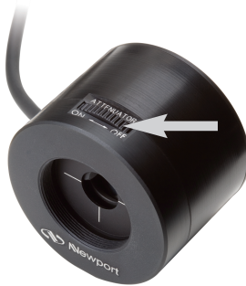
Figure 1 – Model 918D attenuator ‘ON/OFF’ dial