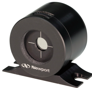
Figure 2 – Model 918D mounted on Base

A base plate kit (Model 918D-Base-Kit), consisting of the plate and mounting screws, is available for using the detector on a flat surface or optical table. A total of 5 screws are provided: 1 set screw to attach the base plate to the detector and 4 screws for attaching the plate to an optical table (2 Metric and 2 English)