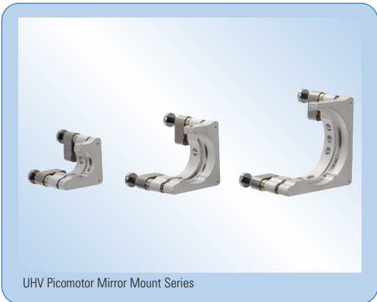
UHV Picomotor Mirror Mount Series

The New Focus™ 882X Clear edge series provides the precision and stability of Picomotor™ actuators with our reliable popular Ultima™ Precision Optical Mounts. These mounts can now be used in UHV environments ( 10^{-9} Torr) as well as for VUV/EUV applications.