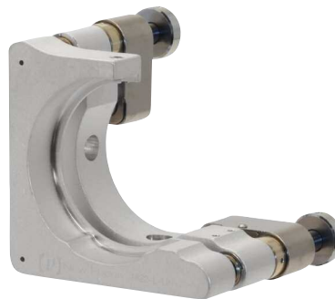
Model 8822-L-UHV 2in Left-Handed UHV Picomotor Mirror Mount