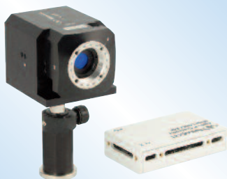
Motorized VA-CB Series Broadband Ultrafast Variable Attenuator Beam Splitter. (Post and post holder sold separately)