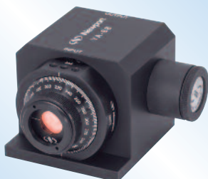
Manual VA-CB Series Broadband Variable Attenuator Beam Splitter. (Beam Dump Shown Installed)