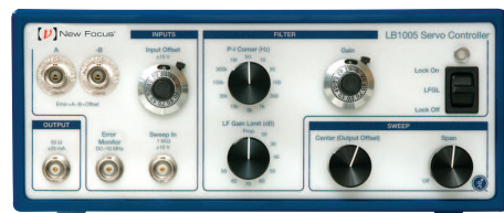
LB1005 Servo Controller