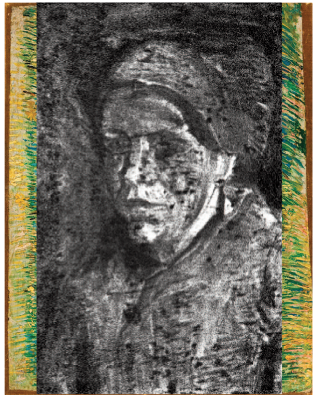
Fig. 2: Elemental map obtained on Vincent van Gogh's "Patch of Grass" showing a hidden portrait of a woman; Sb distribution